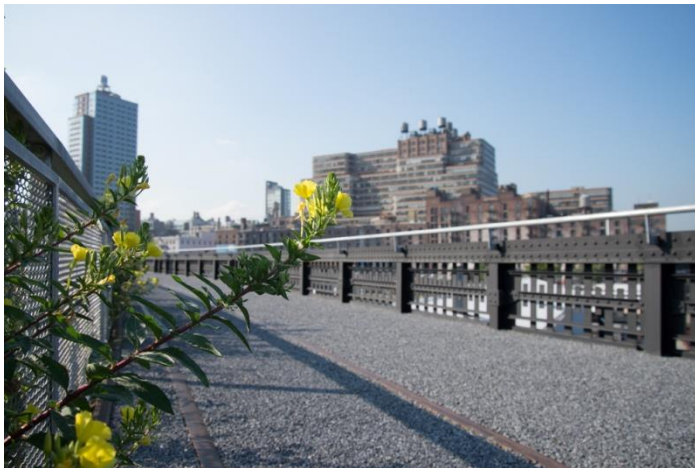
View looking southeast at 12th Avenue, just north of West 30th Street

At the park's northernmost point is the Interim Walkway. This area features a simple path through the existing self-seeded plantings, celebrating the urban landscape that emerged on the High Line after the trains stopped running in 1980. Visitors can take in expansive views of the Hudson River and the cityscape, or relax in any of the four gathering spaces located in this area. Because the Interim Walkway is not lit at night, this part of the park closes earlier, at 6:00 PM.