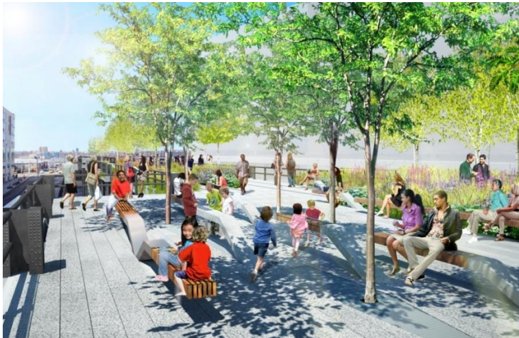
View looking west along West 30th Street, just west of 10th Avenue Rendering by James Corner Field Operations and Diller Scofidio + Renfro. Courtesy of the City of New York and Friends of the High Line.

The 30 th Street Grove is a serene gathering space near 30th Street. In addition to secluded seating and communal picnic areas, the Grove also houses an assortment of new design elements, including the peel-up sound bench – a chime feature for children – and the peel-up rocker.