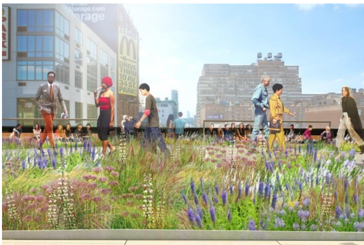
View looking south at 11th Avenue Rendering by James Corner Field Operations and Diller Scofidio + Renfro.

As the High Line runs west over 11th Avenue, the main pathway gradually slopes up about two feet, creating an elevated catwalk from which visitors can view the park, the cityscape, and Hudson River. Lush display gardens on either side of the catwalk will separate the main pathway from the more intimate linear bench seating running along the railing on either side of the bridge.