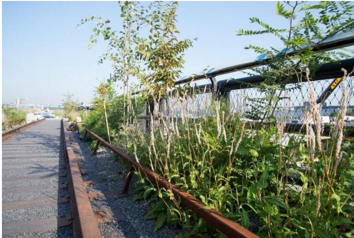
View looking west along West 30th Street, just west of 10th Avenue

These three linear walks – located in different areas along the High Line at the Rail Yards – expose the High Line’s rail tracks, evoking the High Line’s history as an active freight rail line. On these walks, visitors can interact with artifacts such as the rail “frog” and the rail switches, or rest in one of several alcove pockets of peel-up benches located throughout the pathways. Planting beds featuring Piet Oudolf’s naturalistic landscape border the pathways.